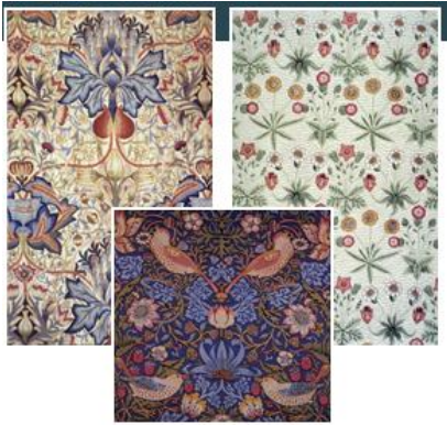
Example of Morris' wallpaper

William Morris was a designer who created wallpaper, inspired by nature, during the Victorian period, when it was only affordable for the very rich. He used block printing to create his repeating patterns.